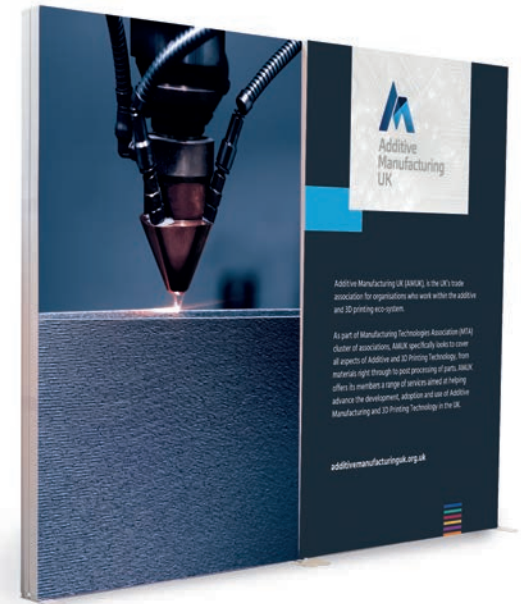
Example: 2 x 3 m x 2 m lightbox panels placed side-by-side to create a backwall

We can provide rechargeable two-metre and one-metre-high lightboxes , compact displays that are typically used to welcome visitors. If you are seeking larger lightboxes, we also offer two-metre and three-metre-wide lightboxes that can be used to create a backwall.