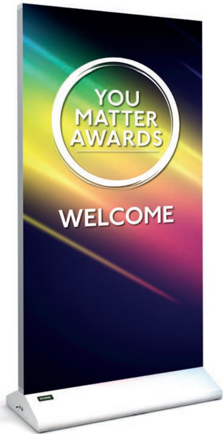
Example: Rechargeable 2 m x 1 m lightbox